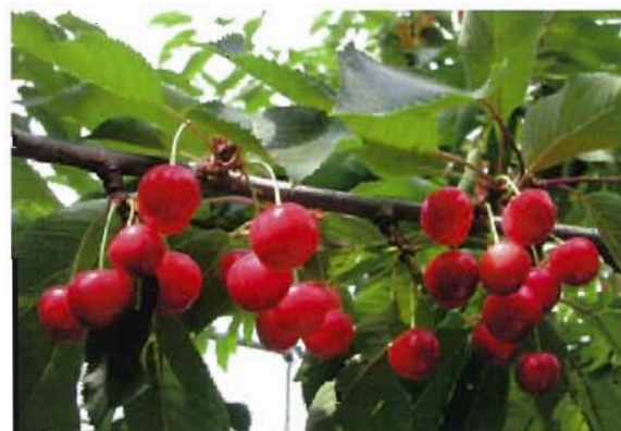
Fig. All fruition become large.