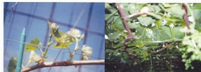
Fig.Beginning of bud.