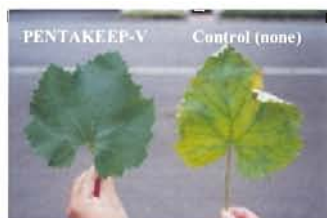
Fig. Effects of PENTAKEEP-V on grape leaves.