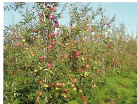
Fig. In terms of harvest.