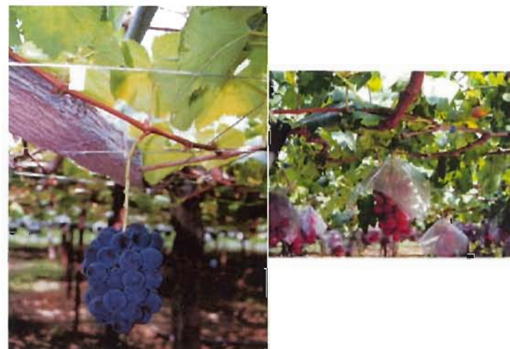
Fig. Effects of PENTAKEEP-V on grapes.