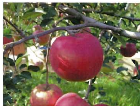
Fig. Fruits up-growing.