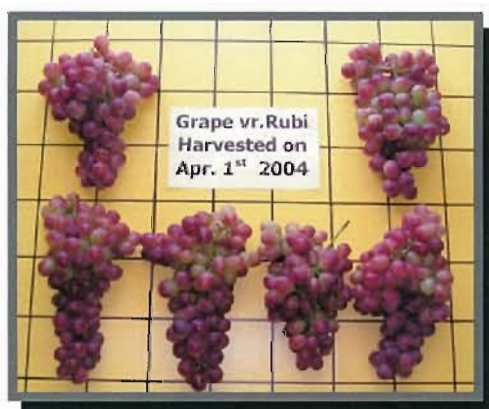
Fig. Grape “Rubi“